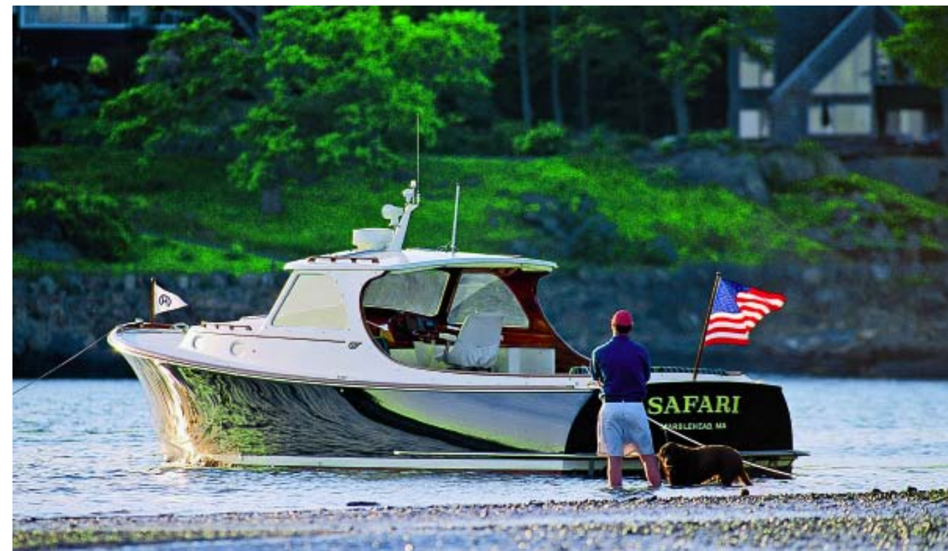
Top rendering courtesy of The Hinckley Company; Bottom photo Rich Armstrong/Soundings